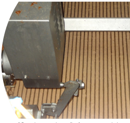
"Continuous layer" of meat emulsion