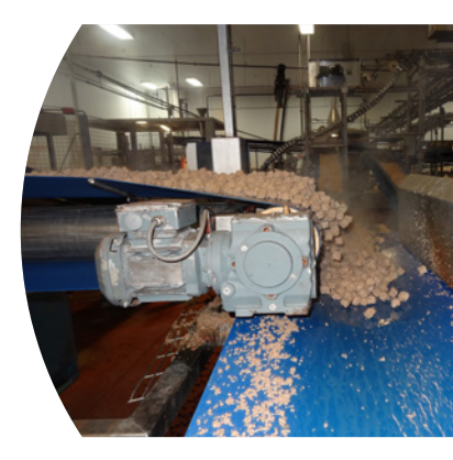
Heatset chunks after extruding and steaming