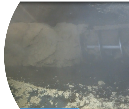
GVA pump Inside the hopper - Archimedes screw

It will be necessary to size the gavo pump with a pressure tolerance. Even if the application case has been observed at 5/7 bar, the pump can handle pressures variations to 14 to 16 bar.