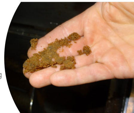
Wet animal flour for pet food applications