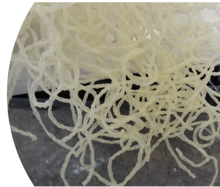
Gelatin brittle noddles after drying