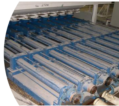
Barcelona metro - Spain 20L40 pumps on grout injection, 1 m 3 /h -40bar