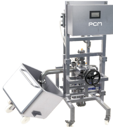
End of production