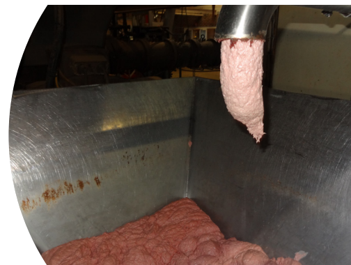
MSM (Mechanically Separated Meat)