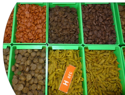
Visual control of dry petfood - colourings validation

Associate a flowmeter to control the dosing.