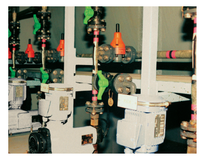
Ferric chloride pumping in purification station.