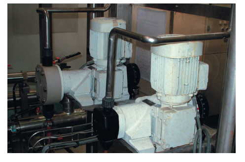
Metering of soda and acid.