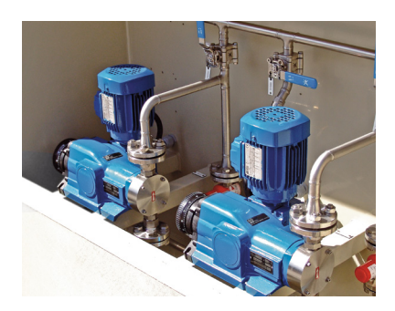
Sulfuric acid metering in mining