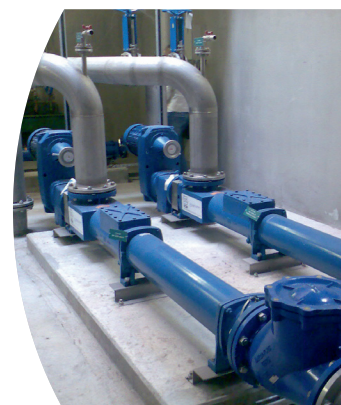
Sodium Cyanide solution - I series Gold mining